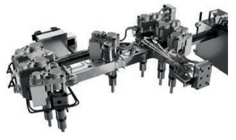
FLEXflow servo driven valve gate

Suitable for smaller injection pressing machines and PP, ABS and PC/ABS polymers. Perfect for big size automotive components like bumpers and other sectors applications like waste bins and pallets