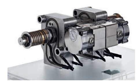
Compact stack mould